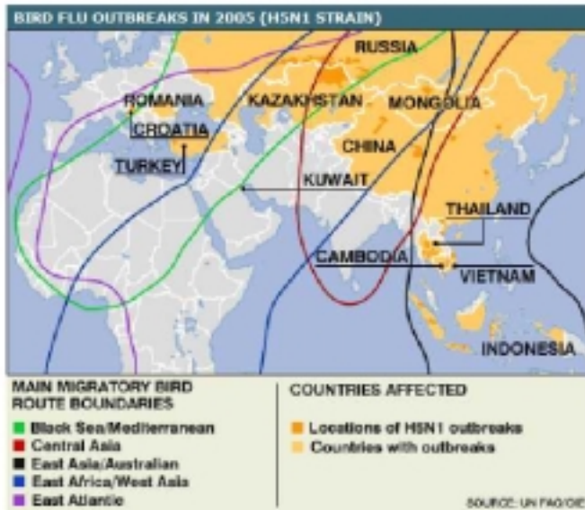
The Global Spread of the Avian Flu: November, 2005