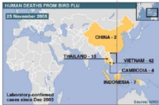
Avian Flu Deaths by Country: November, 2005

Direct contact with infected poultry, or surfaces and objects contaminated by their droppings, is considered the main route of human infection. Exposure risk is considered highest during slaughter, defeathering, butchering, and preparation of poultry for cooking. WHO continues to recommend that travelers to affected areas should avoid contact with live animal markets and poultry farms, and any free-ranging or caged poultry. Large amounts of the virus are known to be excreted in the droppings from infected birds. Populations in affected countries are advised to avoid contact with dead migratory birds or wild birds showing signs of disease. There is no evidence that properly cooked poultry or poultry products can be a source of infection.