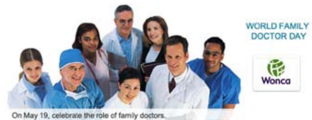
Canada developed posters in English and French