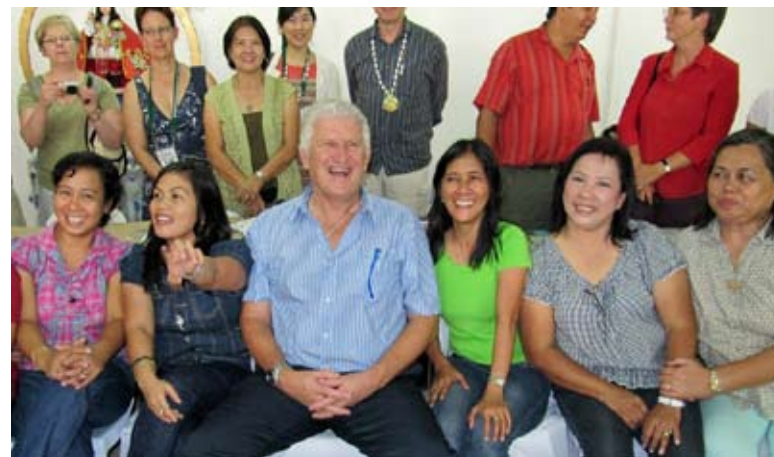
The group visited a community health centre where Prof Ian Couper proved popular with the community health workers.