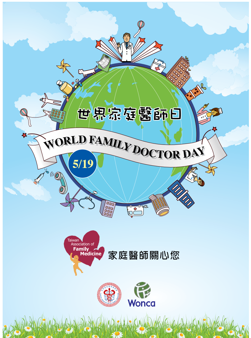
"The Family Doctor cares for you" – a poster developed by the Chinese Taipei Association of Family Medicine

The College shared with its member, its Motto Cooperating for Excellence ; and prayer – the prayer of Maimonides: