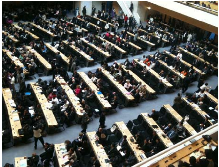
View of the World Health Assembly meeting in Geneva.

This year, there was a curious disconnect between the official debate and less formal discussions away from the floor of the Assembly. Numerous delegates spoke out on the floor and in committees of the continuing need to strengthen health systems and to advance integration of care through primary care. Yet, the buzz in the Serpentine coffee shop of the Palais and the NGO-sponsored panel presentations at the hotel receptions focused on NCD.