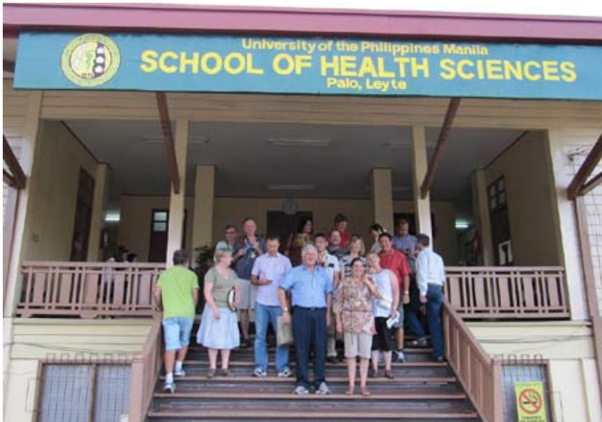
In Palo, near Tacloban, the group visited the University of Philippines- Manila School of Health Science where the 'step-ladder' curriculum allows training in steps: from midwifery certificate, to nursing degree, to community health degree, and finally for some students an MD.