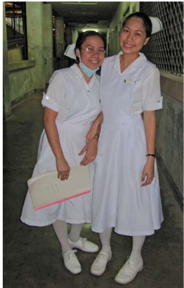
Nurses at the Tacloban hospital, where the group undertook a site visit.