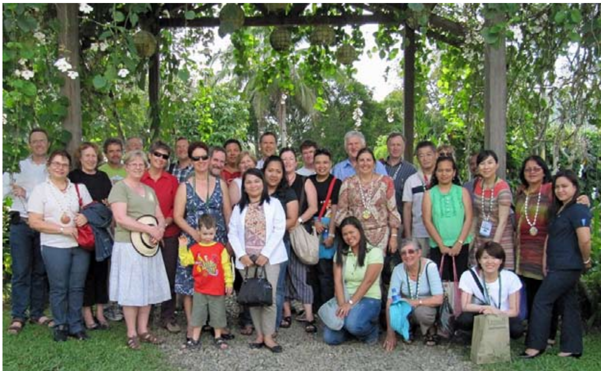
The Tacloban post conference group photo