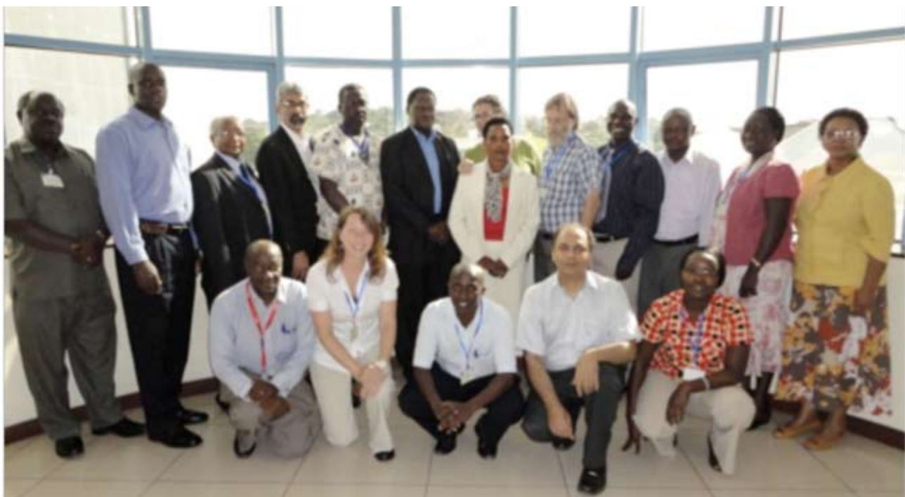
Delegates from the East Africa Family Medicine Initiative met in Mwanza in May 2011 to discuss collaborative efforts

Delegates attended the two-day event to discuss the definition and value of family medicine as a specialty within East Africa. Uganda has trained doctors in the principles of family medicine for over twenty years at Makerere and in Mbarara, and Kenya has been teaching family medicine through Moi University for seven years, and they were able to share their experience with those participating in the initiative. Rwanda has recently begun training in this specialty with rural teaching facilities. The Aga Khan University is training family doctors in Dar Es Salaam and will soon begin a district hospital course in Kenya. This specialisation takes an additional two to five years after an MD degree.