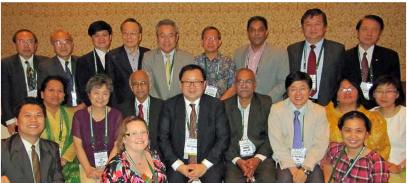
Wonca Asia Pacific council in Cebu.

We finally lay to rest the Finance Committee established three years ago. With a meagre budget, Wonca APR Council surmised that the continuance of a three member committee to manage these meagre amounts was futile.