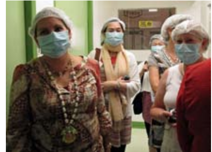
The group masked up for a visit to a Government Pharmaceutical laboratory where drugs based on locally grown herbs are manufactured.