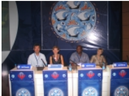
WPA Conference in Istanbul in July 2006 showing our delegation of speakers talking on 'From Conception to Death: A Mental Health Primary Care Pathway'

The mission and vision of the Working Party on Mental Health is to improve mental health care around the world by providing a universal gold standard of care for mental health through empowerment of primary care and in collaboration with all interested stakeholders.