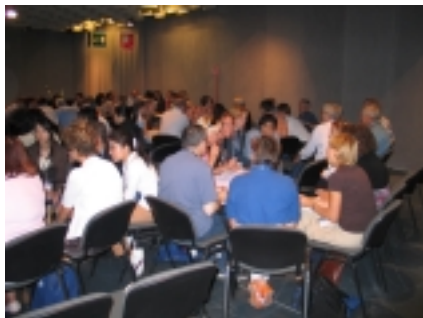
Wonca Europe Regional Meeting in Florence in August 2006 showing our workshop held on 'Dementia Management in Primary Care'