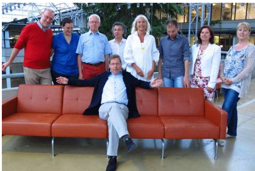
Photo above: WONCA Europe executive joking with the WONCA Europe President in Copenhagen in June 2016.

Each of the WONCA Europe conferences in this triennium has led to a formal “statement” from WONCA Europe. In particular, the WONCA Europe 2015 Istanbul Statement, “Refugees should have access to equitable, affordable and high-quality health care services in all Europe”, has received much attention and positive responses.