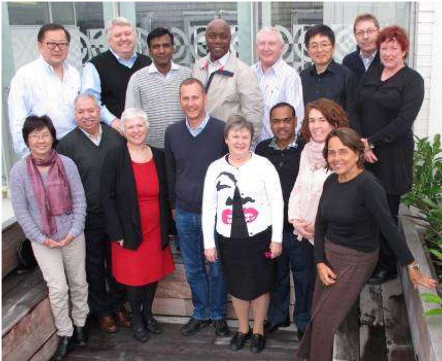
Photo- with WONCA World Executive - January 2014

This is my final report to you as WONCA President and so I would like to share with you some reflections on the huge amount of work that is carried out by WONCA and our dedicated family doctor members and supporters all around the world.