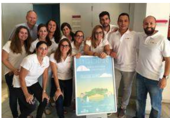
Photo: Residents and Young GPs members of Organizing and Scientific Committees.

The Balearic and Spanish Societies of Family and Community Medicine (Ibamfic and SemFYC) have the great honor to invite you to the IV Balearic Meeting of European Residents & Young GPs - "Connecting Doctors", which will be held in Palma de Mallorca on October 21st and 22nd of 2016.