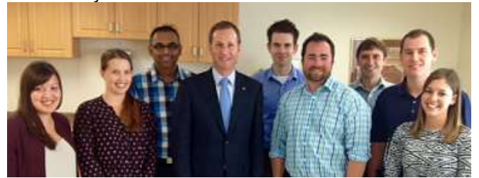
Imagen: Presidente de WONCA con jóvenes médicos de familia en la zona rural de Ontario, Canada.